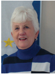
New Summit School, Jackson January 2010