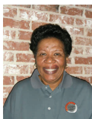
Mississippi Community Education Center January 2010