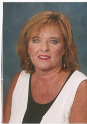
North New Summit School, Greenwood January 2010