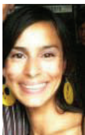
New Summit Academy, Costa Rica January 2010